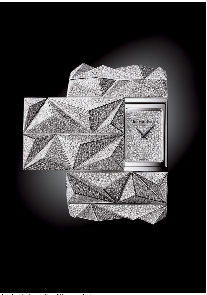
Jewelry: Audemars Piguet Diamond Punk

Ladies High Mechanicals: Faberge Peacock. The CEO of Faberge actually brought with him an historic bust of Faberge' to celebrate. He then went on to thank his remarkable team.