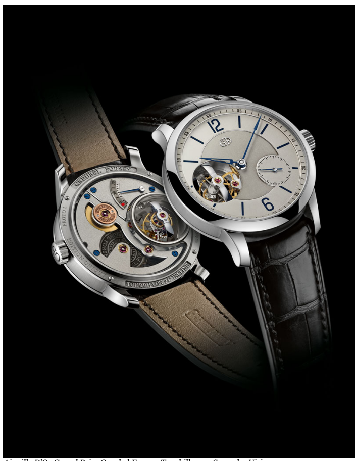
Aiguille D'Or Grand Prix: Greubel Forsey, Tourbillon 24 Secondes Vision