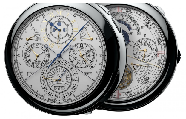
Vacheron Constantin Ref. 27260, the world's most complicated watch

This year, in fact, more than 200 <u>watches</u> were submitted for a spot in the final selection. A panel of judges then further narrowed that 200 to about 72 watches – of which just about 16 watches will win. Here we bring you the winners of each product category. Additionally other prizes were awarded for creative talent (including young students) and watchmaking expertise.